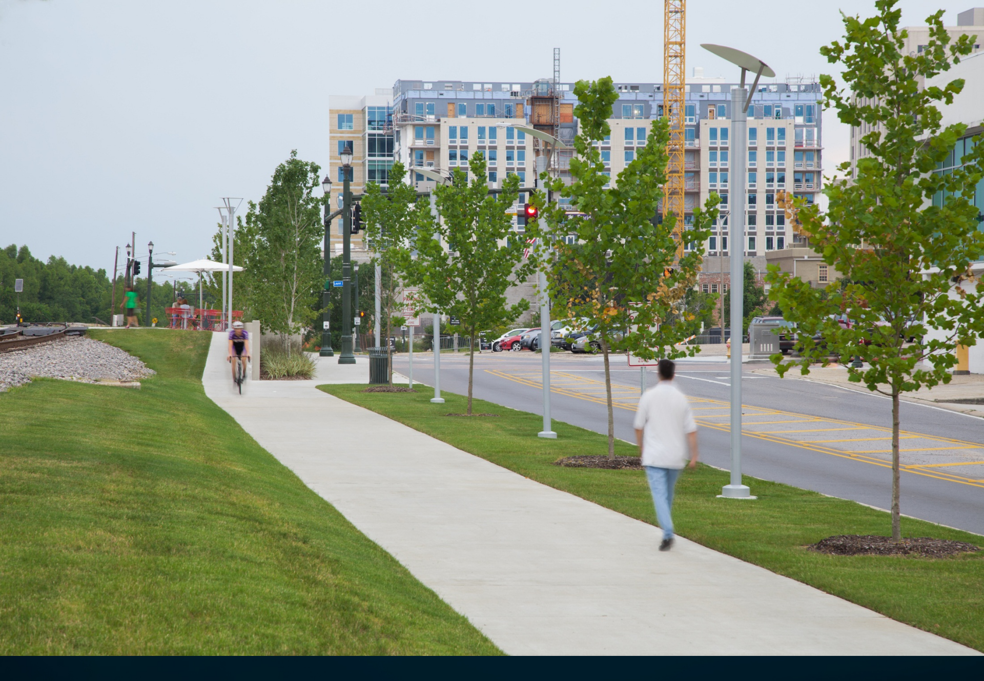
Multi-use pathway leading to Florida Street Riverfront Gateway