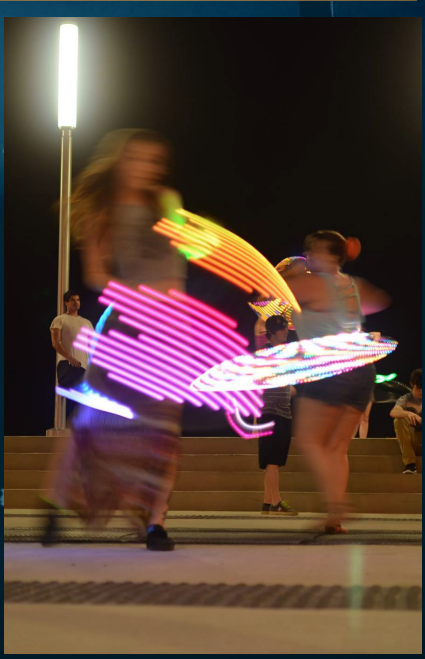
Baton Rouge Fire Guild