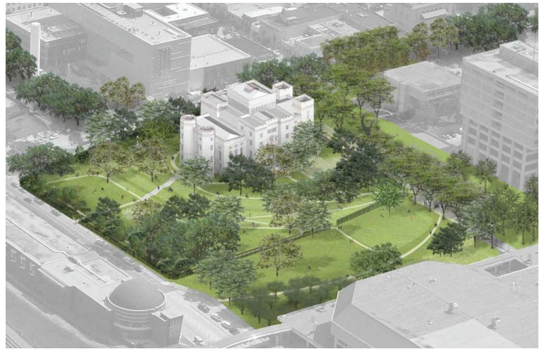
'Central Green': Birdseye View Rendering from Plan Baton Rouge II

The Central Green, a recommendation from the Plan Baton Rouge II Master Plan, draws its significance from the aggregation of cultural and civic buildings that surround it, including City Hall, the Public Library; The Old State Capitol; The Shaw Center; The Louisiana Art and Science Museum; The River Center; The 19th Judicial District Courthouse; The Theatre for the Performing Arts; and the downtown hotels.