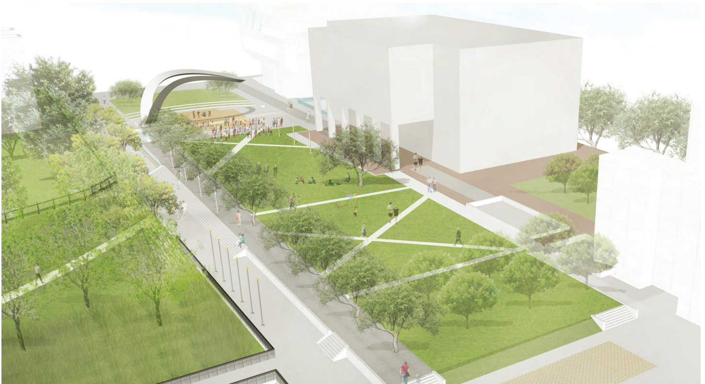
City Hall Plaza and the 'Central Green': Birds' Eye View